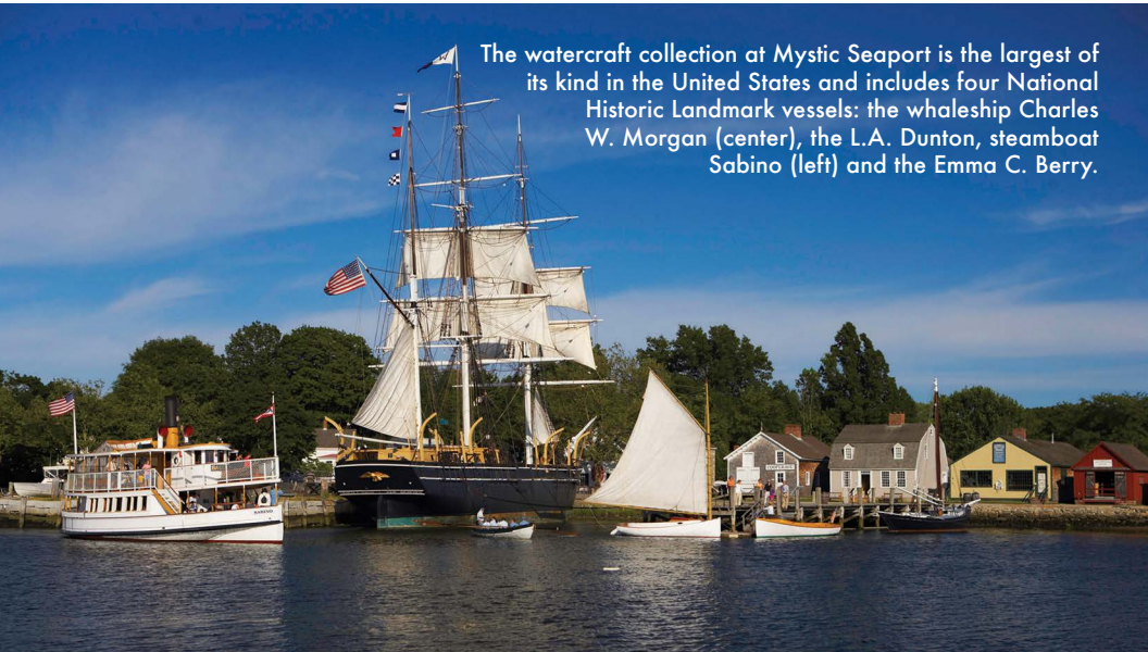
The watercraft collection at Mystic Seaport is the largest of its kind in the United States and includes four National Historic Landmark vessels: the whaleship Charles W. Morgan (center), the L.A. Duntun, steamboat Sabino (left) and the Emma C. Berry.