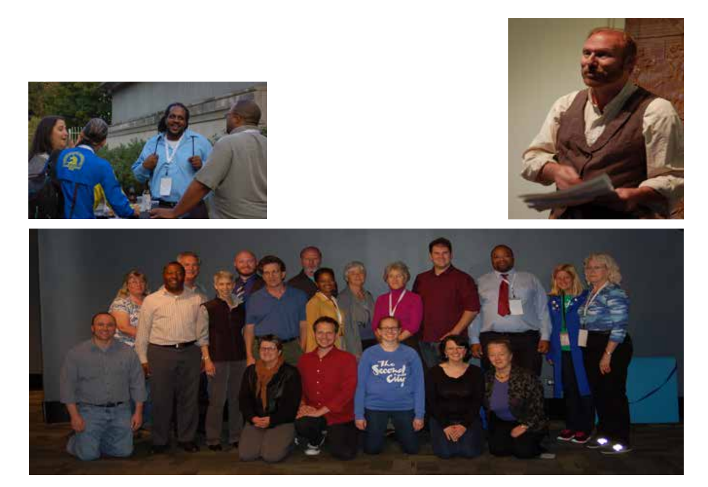
Insights Winter 2015 / vol. 25, issue 1

We're looking for articles, opinions, and news about events, programs, your site, and your self. Articles and opinion pieces can be from 250 to 3,000 words long; must be in MS Word (.doc preferred, please); and it would be really nice if you could format your file to be double-spaced, first paragraph indented, 11- or 12-point Times new Roman or similar. But the most important thing is to send us your article, opinion, or news to publications@imtal-us.org no later than March 20, 2014 . ( It doesn't have to be perfect; it just needs to be reasonably coherent. If we have questions, we'll contact you. )