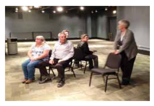
IMTAL 2014 Conference

Throw your hat in the ring: send a brief statement of interest and biography to president@imtal-us.org!