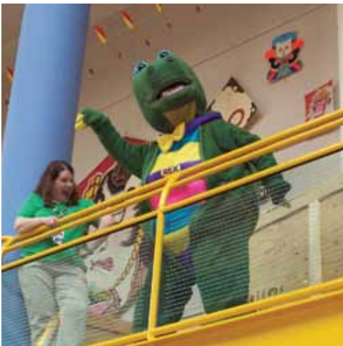
Rex the dinosaur bids visitors farewell after a successful end-of-the-day parade.

After all, that's exactly why we do what we do. And when it works, it works. I once overheard a father after a program commenting to his wife, "It was just a play, but I feel like I learned something." Another time, a parent was complimenting a performance she'd just seen and said to me, "They learn a lot, and they didn't even realize you were teaching them." It's so incredibly fulfilling to hear quotes like that and realize that it did work. These people have seen something that they may have never seen before, and they're taking something amazing—and, we like to think, life-changing—away with them.