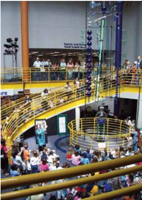
Water clock presentation in the museum's busy atrium, a challenging setting in which to perform.

to school in 1960, I was discussing the cross brandished by protestors to signify their belief that racial segregation was God's will. At that point, a young girl raised her hand and, with absolute sincerity, stated: "Sometimes, you have to share your socks."