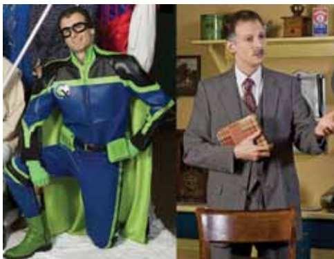
From heroics to history: the author's roles as Captain Extraordinary (left) and Otto Frank (right).

And it serves the same purpose for us. We've all had a busy day, running from program to program and interacting with audiences that are different from any others we've had. We've all had to flex our on-the-spot ad-libbing skills with kids who've asked questions that we've never heard before. Have any of us discovered the universal balance between performer and educator? Nope. But at our parade, none of that matters. The actors get a chance to have one last bit of fun, and to let out a collective sigh at the shared experience of the hectic, exciting, challenging, strange, unexpected, extraordinary day we've all had.