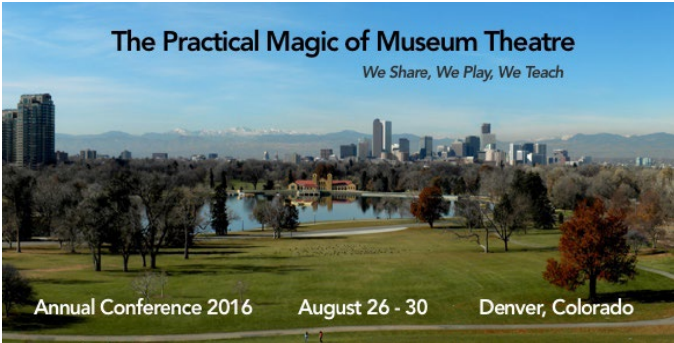
View of Denver from DMNS