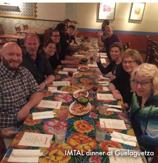
IMTAL dinner at Guelaguetza