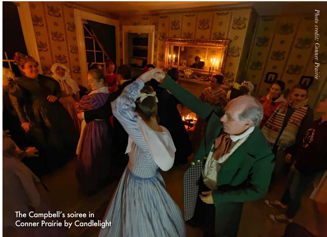
The Campbell's soiree in Conner Prairie by Candlelight