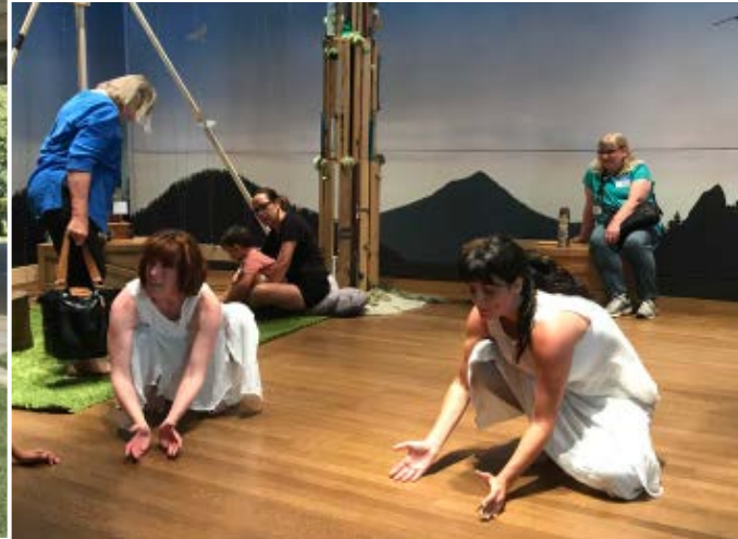
Masterful storytelling and The Whole World is a Narrow Bridge at Skirball Cultural Center

The conference was everything we hoped it would be, except for the poor, misguided bus driver. It showed us that we who are IMTAL are still, as ever, a vital part of museum culture, in the U.S. and around the world. It renewed our commitment to education and sharing of ideas, techniques and technologies. The sharing of our weaknesses, of our strengths, our desires, and our fears, and it reminded us that once the spark is struck, the flame that it creates needs to be fed. Feed it a regular diet of compassion and hope, daily meals of curiosity and joy. Tend to it, and not only will it keep you warm, that flame will light the way. ❖