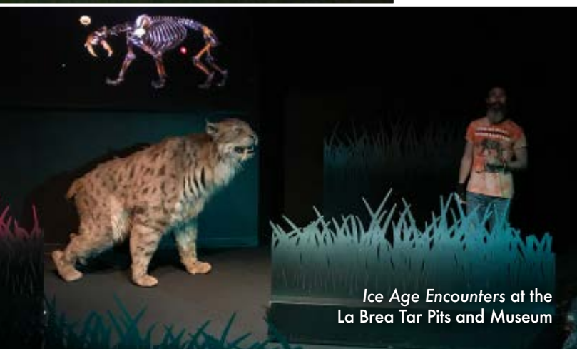
Ice Age Encounters at the La Brea Tar Pits and Museum

most everyone was as exhausted and excited as I was after day one.