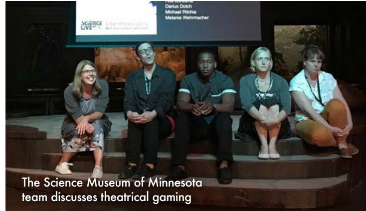
The Science Museum of Minnesota team discusses theatrical gaming

that such programming presents. The SMM team is tight-knit, and they are risk takers. Their audiences