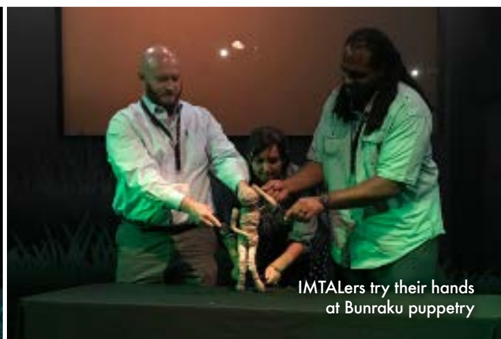
IMTALers try their hands at Bunraku puppetry